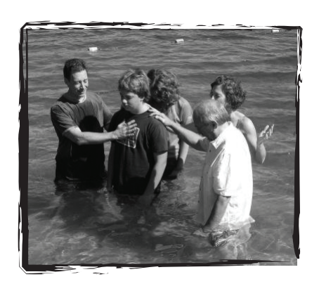
Holy Spirit come To be the me I'm to be I need more of You

And we, who with unveiled faces all reflect the Lord's glory, are being transformed into his likeness with ever-increasing glory, which comes from the Lord, who is the Spirit.