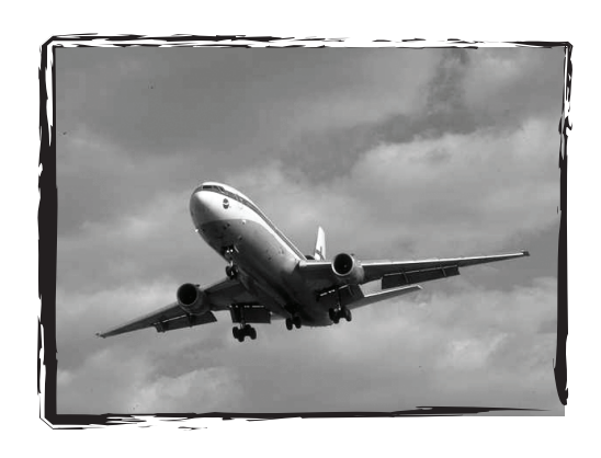
Seat belt lights are on Turbulence awaits us all Will you be shaken?

So be on your guard; I have told you everything ahead of time. "But in those days, following that distress," 'the sun will be darkened, and the moon will not give its light; the stars will fall from the sky, and the heavenly bodies will be shaken.' "At that time men will see the Son of Man coming in clouds with great power and glory. And he will send his angels and gather his elect from the four winds, from the ends of the earth to the ends of the heavens.